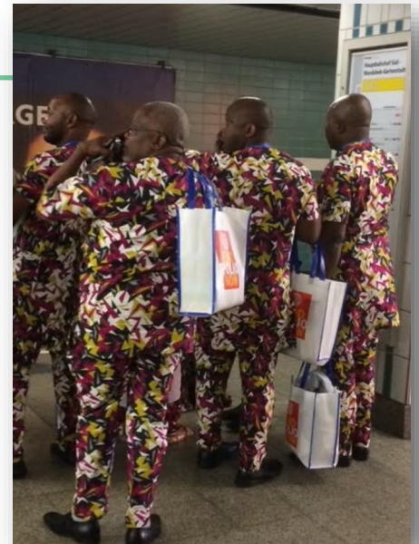
Rotarians from Africa at the Hamburg Convention

The opportunity is there for all of us to share in the excitement of RICON 23, even if it is not possible to attend the Convention itself. Volunteers are needed for a vast array of jobs and this opportunity is open to Rotarians, friends and family. If the task is inside a Convention venue, volunteers will need to be registered for the Convention, but there are many other roles that will be required for jobs outside the venues.